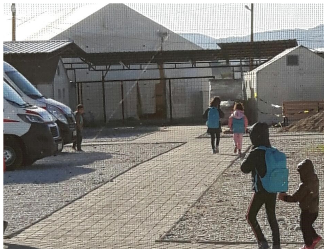
A day in October at TC Vinojug

At the end of October, upon a request letter submitted by MYLA, the Ministry of Labor and Social Policy brought a decision that all asylum seekers from TC Vinojug will be transferred to the Reception Center for asylum seekers in Vizbegovo and that this will be the practice in place for the future as well, but so far, the asylum seekers are still accommodated in TC Vinojug and waiting for this decision to be executed.