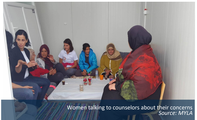
Women talking to counselors about their concerns

On September 8th 2016, one person left TC Vinojug voluntarily. He explained that the reason for his leaving is reunification with his family in Turkey. On September 10th 2016, one family from Afghanistan that had been intercepted by the Macedonian police in an attempt to enter in Macedonia irregularly was accommodated in the center due to medical emergency. After two weeks, they left TC Vinojug upon their request. On September 29th 2016, one family from Afghanistan that was interested to apply for asylum, was accompanied by one of MYLA's field lawyers to the Police station in Gevgelija to file an asylum application.