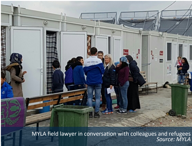
MYLA field lawyer in conversation with colleagues and refugees

The situation in TC Tabanovce in September remained relatively the same as in the previous few months. The number of refugees transiting in the area has been increasing on a daily basis, especially during the nights. Generally, the changes depend of the push backs made by the Serbian police. The refugees that were noticed passing through the center were mostly from Algeria and Morocco and almost all of them were men. The police this month was really strict and did not allow them enter the camp for more than several hours.