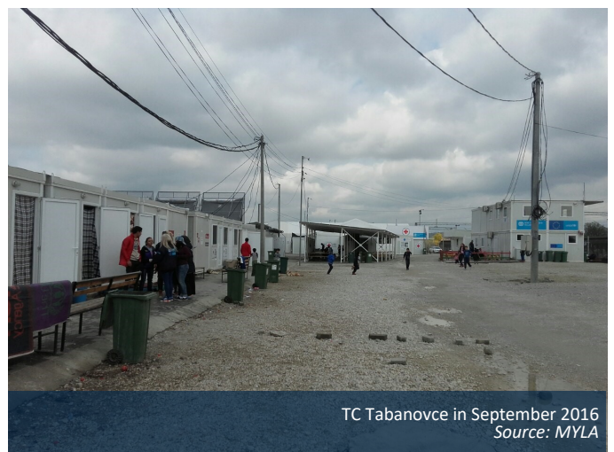
TC Tabanovce in September 2016

The police and military forces have had an increased presence patrolling the neighboring villages and the border zone with Serbia in September. The intention of their increased presence was to prevent smugglers and irregular crossing of the border with Serbia. Nevertheless, this measure has not decreased nor has it prevented prevent the smugglers and irregular crossings of the border with Serbia as there is a increase of the smuggling activities, migration transition and push backs.